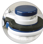
Extra weight (optional)