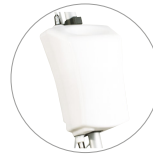
Tank 12 l (optional)