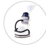
Suction kit (optional)