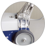
Articulation of the handle