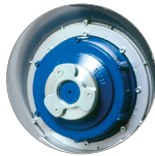
Mount for drive boards and brushes